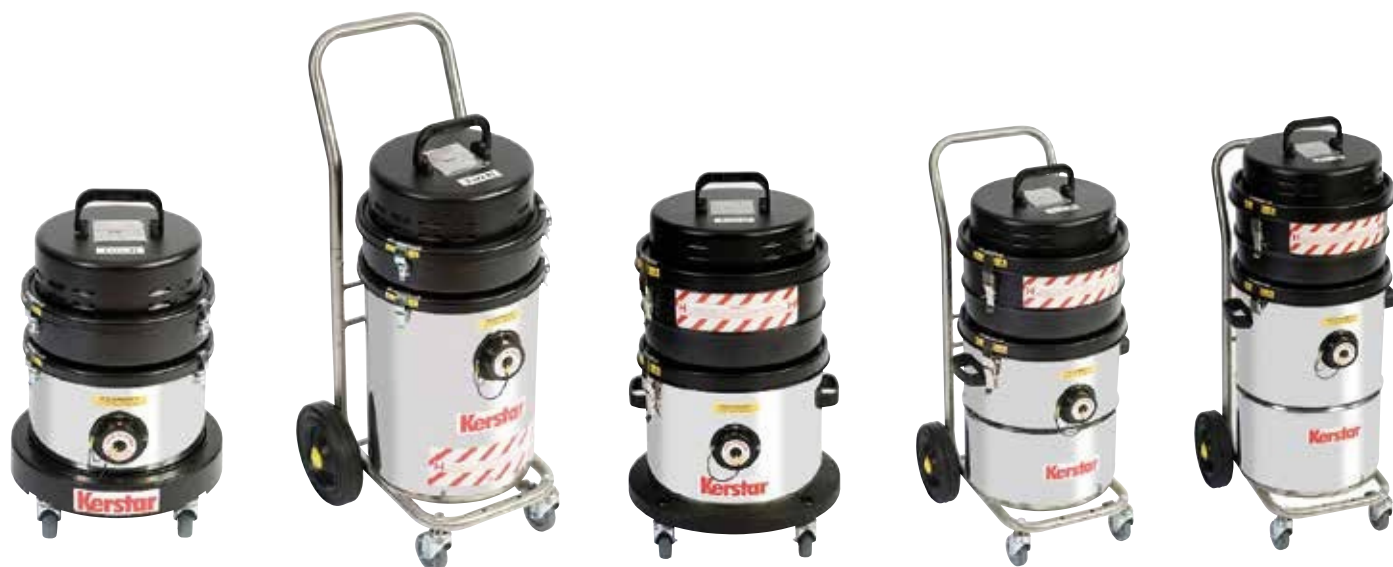
KAV 15H, 18H, 20H, 30H and 45H