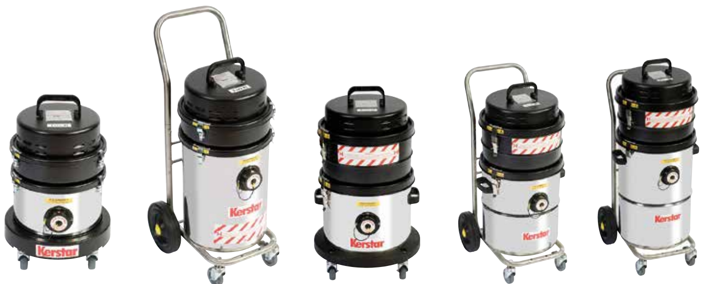
KAV 15H, 18H, 20H, 30H and 45H