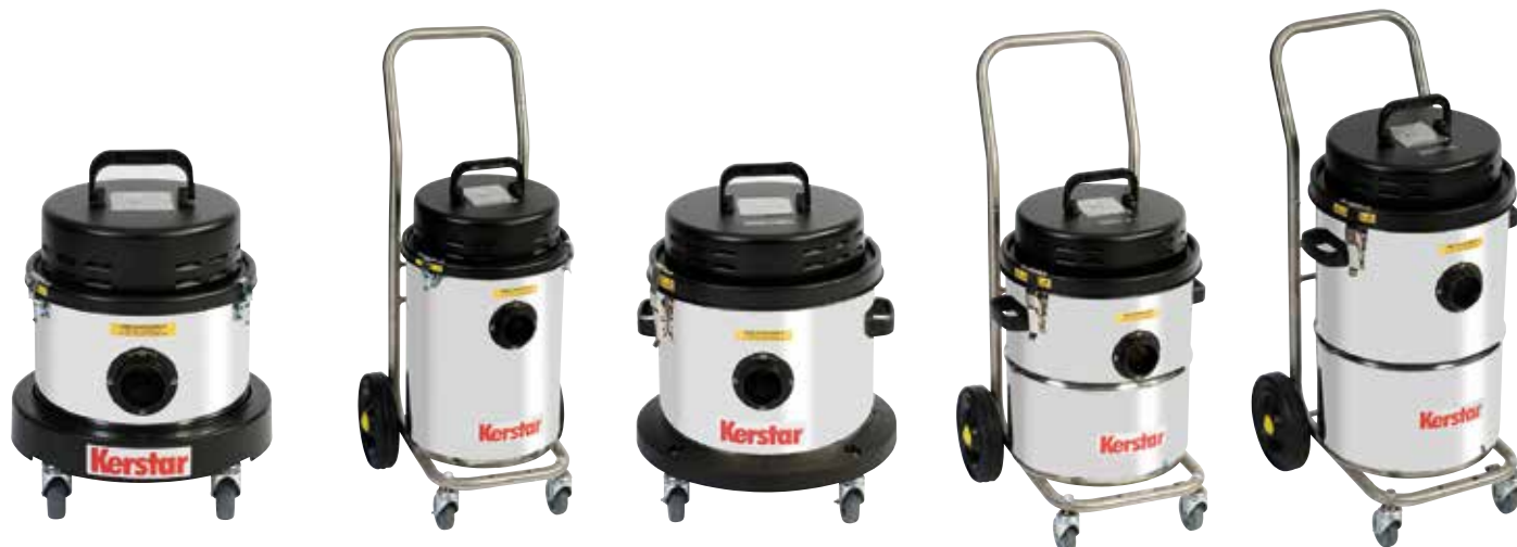
KAV 15, 18, 20, 30 and 45