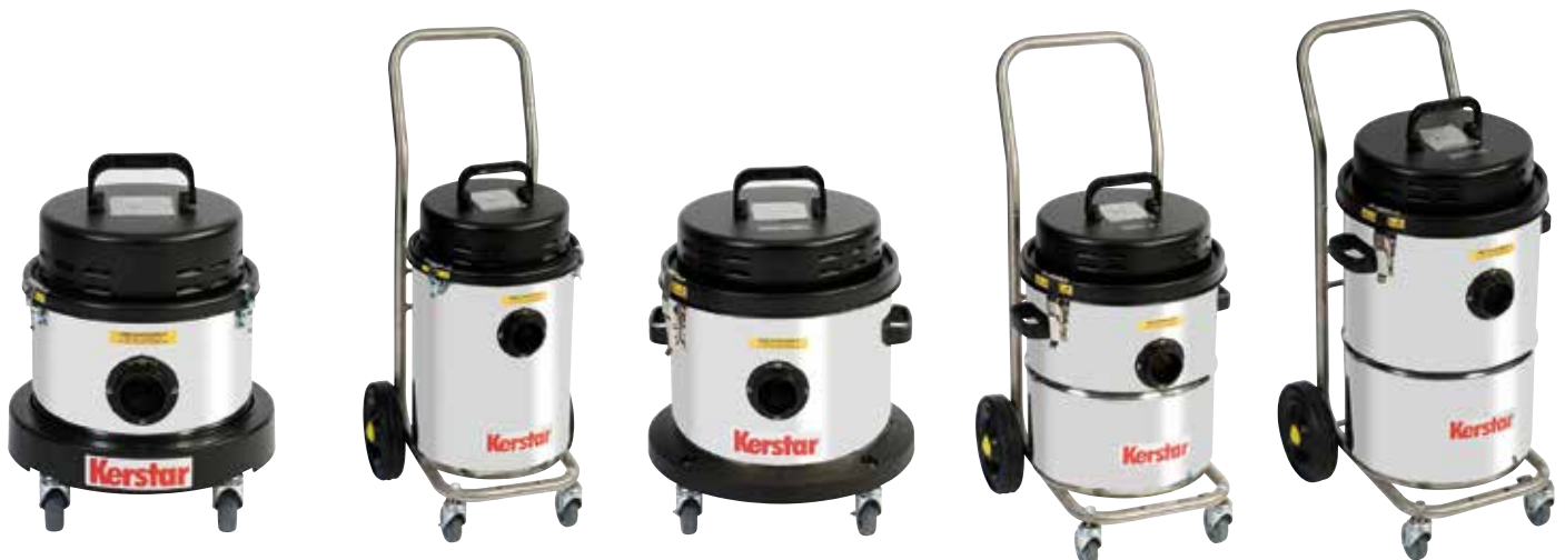
KAV 15, 18, 20, 30 and 45